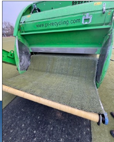
In February, work began on removing the old material.

Then the snow came. A good three months before the tournament was due to start: everything came to a standstill. What would happen next?