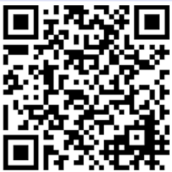
F4-Turnier 9 Uhr