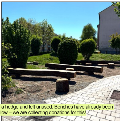
On the left is the area that was previously separated by a hedge and left unused. Benches have already been installed here, and play equipment is to follow – we are collecting donations for this!